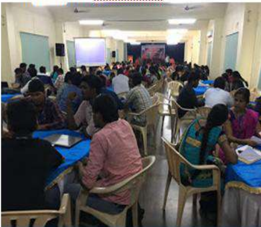
Smart India Hackathon