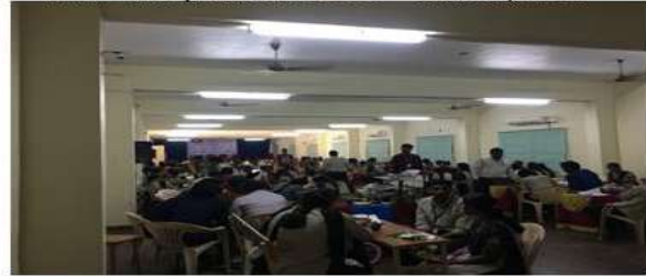
Proof of Concept Exhibition on 15 th June, 2019