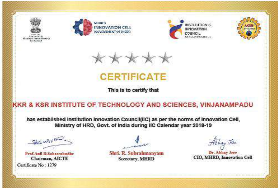
Establishment Certificate issued by MHRD-MIC