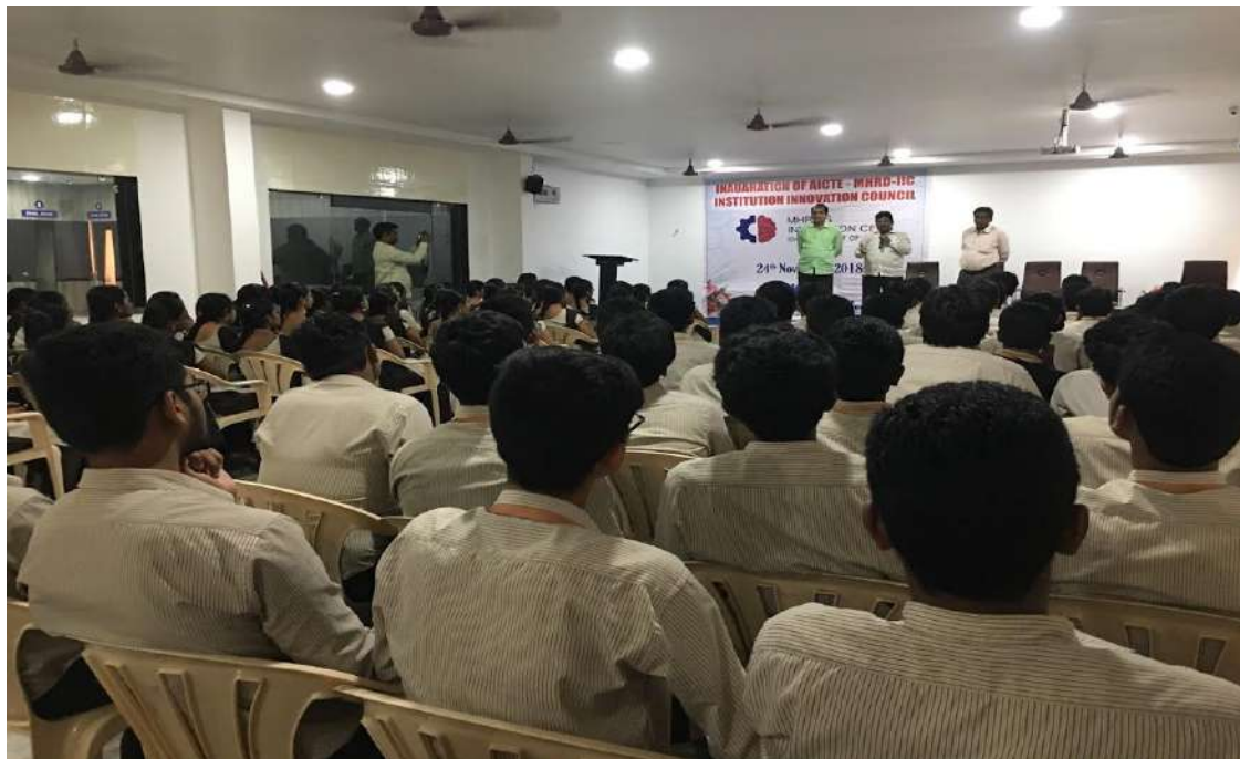
Inauguration of IIC at KITS