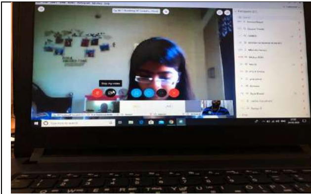
Inauguration of FDP on 25-05-2020