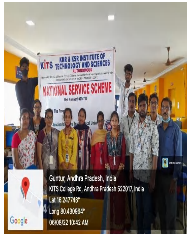
Photos of Essay Writing