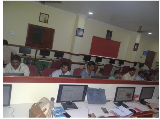
Participants working on the lab exercises given by the Academy