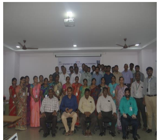
Group photo for all the participants with college management and principal