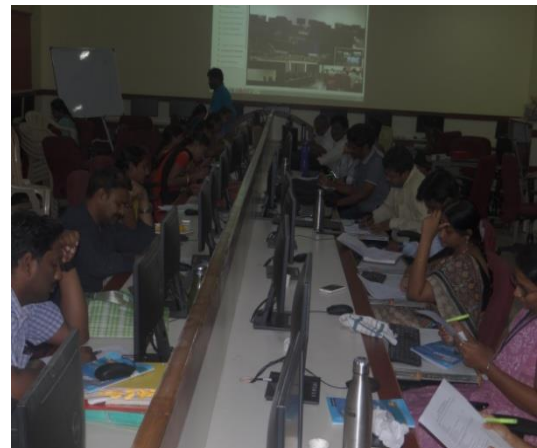
Participants writing their first quiz examination as a part of the FDP Course.