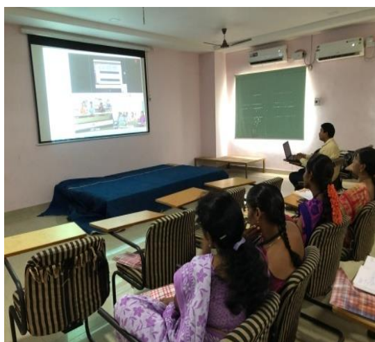
Inauguration of Deep Learning FDP through online