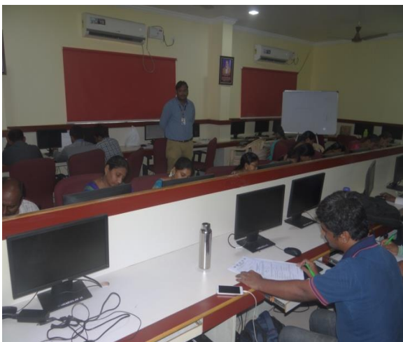
Participants writing their second quiz examination as a part of the FDP Course.