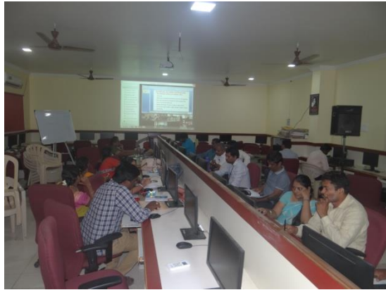
Participants working on the lab exercises given by the Academy