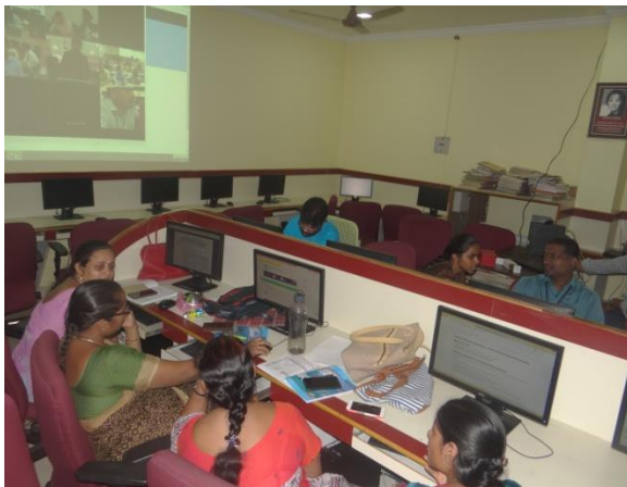
Participants discussing on topics for asking the doubts