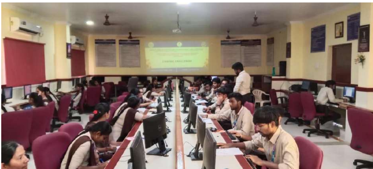
CSI Student Chapter, KITS , organized “ICT QUIZ” on 11-10-2023